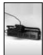
MR 16 Striplight