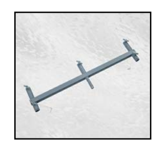
Jr. Triple Header