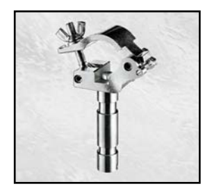
Jr. Pipe Clamp