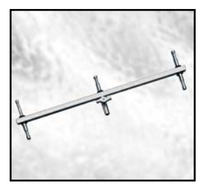
Baby Triple Header